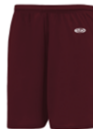
BMHS P.E. SHORTS $12.99