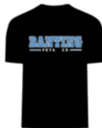
BMHS P.E. SHIRT $12.99

If desired, students can purchase Banting Phys Ed T-Shirts or Shorts from Boulton's Replay Sports online at boultonsreplaysports.com . Boulton's is located at 40 Victoria St E, Alliston.